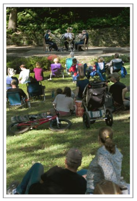
September 2012 Free Concert with Philadelphia Brass

Please keep the enclosed calendar of upcoming events, visit our website, and enjoy the park!