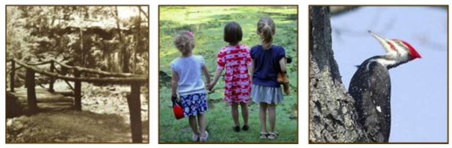
Above: Original footbridge, Pond Walk for Kids, Pileated Woodpecker. Below: Dedication plaque.

To preserve and enhance the historic and natural resource of Glen Providence Park.