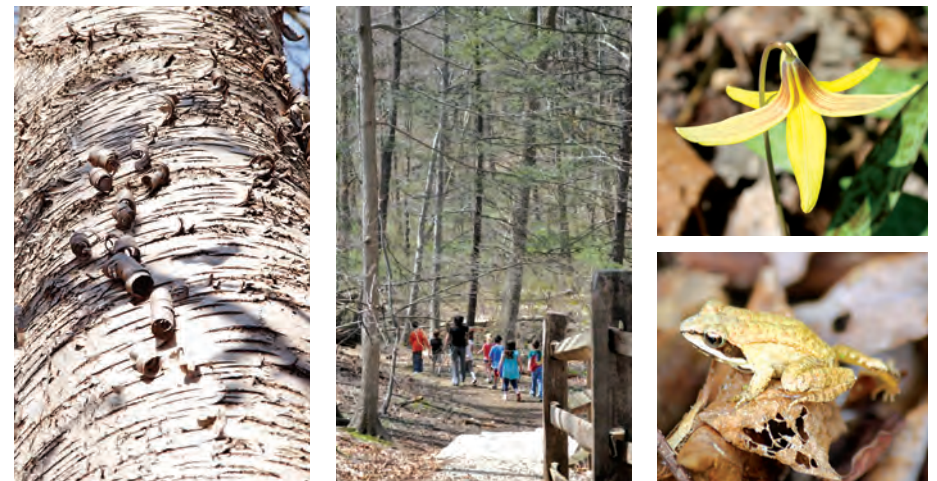
Clockwise, top left – Birch Bark; MPFS Class in the 1.1 Acre; Trout Lily; Wood Frog.