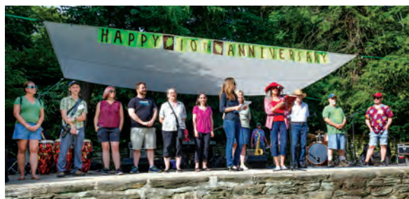
Clockwise, top left — Pond Walks and Tree Walks for Kids; Naturalist Walk; 10th Anniversary Celebration; Bird Walk.