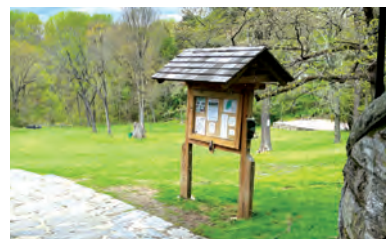
Clockwise, top left – Planting; National Public Lands Day 2015; Trail Posts Installation; American Chestnut Planting; Main Entrance Kiosk; Digging.