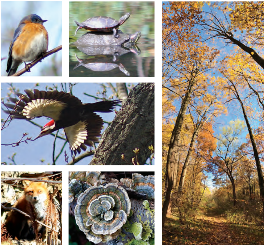
Clockwise, top left – Eastern Bluebird; Piggybacking Turtles; Shingle Mill Trail; Turkey Tail Fungi; Red Fox; Pileated Woodpecker in Flight.