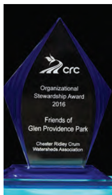
Clockwise, top left – Clearing the Stage in 2011; Spring Cleanup; 2016 CRC Stewardship Award; Conservation Crew; Friends with Delaware County Parks & Recreation Superintendent.